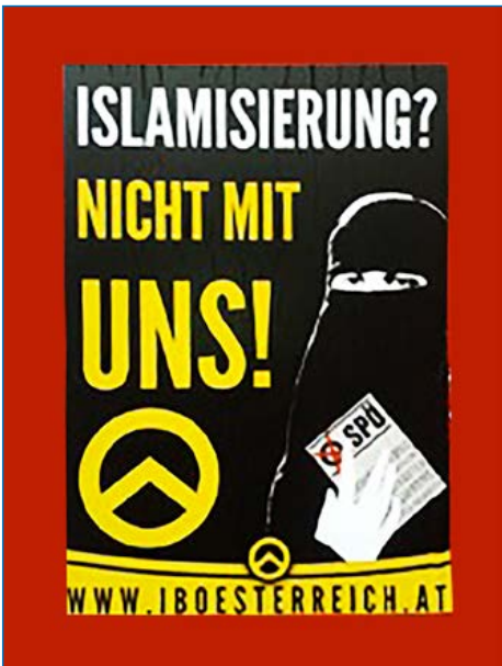
Poster 'Islamisation – Not with us' by the Identitarian Movement Austria 41

[...]” 39 Frequently, they appear in public by disturbing open conference debates by anti-racist NGOs or by putting up posters in public spaces without permission, warning of losing the homeland or against an imagined threat of ‘Islamisation’. Recently, their leader was given a podium in a live debate in a programme of the Austrian broadcast TV ORF. 40 41