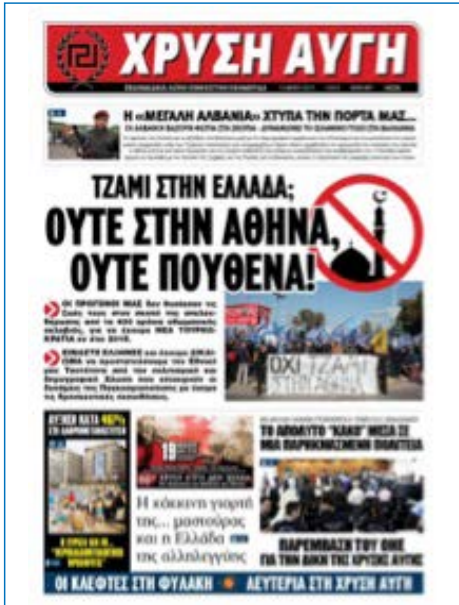
Figure 1: The official Newspaper of GD. The headline reads "A mosque in Greece? Neither in Athens, nor in any other place!"

the country's sovereignty and national identity. The same arguments were presented in September 2015 during a discussion in the Municipal Council of Athens, where GD is present since 2010. In this discussion the mayor of Athens was accused of supporting 'illegal' migrants and turning huge parts of Athens into "Islamabad". 13