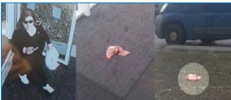
Figure 2. The woman who threw pig heads inside the mosque and in its outdoor parking is caught on CCTV cameras.

There were also numerous Islamophobic incidents in 2015. One of them that received particularly large media coverage was the desecration of the newly opened first purpose-built mosque in the Polish capital. The Ochota Mosque was shot at before its official inauguration in June 2015 with a pneumatic weapon and was a scene of numerous anti-mosque protests; soon after its official opening it was desecrated by a woman who threw pig heads inside the building. 20 The Muslim League in Poland that looks after the mosque decided to drop charges against