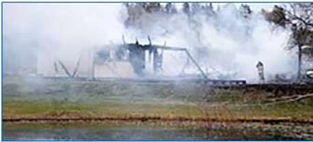
Asylum housing after a fire in Munkedal in October 2015 32