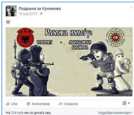
Picture 1. Screenshot from Facebook page made in support after the Kumanovo police operation with the text: Difference between terrorist and a Macedonian defender

In August 2015 there was a large antiterrorist operation in which 9 persons were arrested under suspicion of participation in and recruitment for foreign paramilitary groups. The media reported on the ethnicity of the arrested persons and mentioned one case of a Macedonian who had converted to Islam. The debate about the motivation for participation in foreign armies – whether this was due to religious convictions or money – was raised. 32 33 34