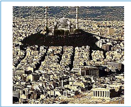
Figure 5: A huge mosque dominates Athens.