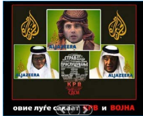
Picture 2 : Opposition leaders and journalists are depicted wearing Arab clothing, thus appearing as Muslims; there is the suggestion that all Muslims are terrorists; under the photos is written: These people want blood and war.

In the political arena it was noticed that Islamophobia was used as a means to make political opponents appear negatively in the eyes of the public.