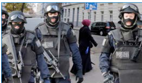
Michael Ley, “Islamisierung Europas: Nein, ich habe keine Visionen,” Die Presse , 19 June, 2015, accessed on 28 January, 2016, http://diepresse.com/home/spectrum/zeichenderzeit/4758713/Islamisierung-Europas_Nein-ich-habe-keine-Visionen

The tabloid press associated the issue of the Muslim kindergartens and the alleged radicalisation of young children with criminal acts of fraud charge for evading state subsidies. The Kronen Zeitung published an article called “Large-Scale Raid in Vienna’s Islam-kindergartens”. The picture showed heavily equipped policemen with a veiled Muslim woman behind them. 100