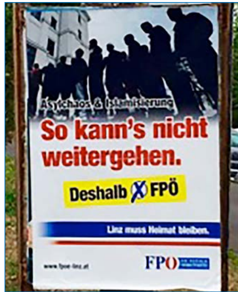
Three elections took place in 2015. During the Upper Austrian elections, the FPÖ on its posters called against “Asylum Chaos and Islamisation”.