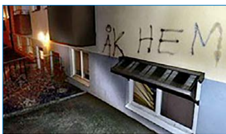
A Mosque in Mariestad vandalised by graffiti saying 'go home' in Swedish (El Mochantaf 2015) 28

Parallel to these damages are the attacks and incidents involving asylum housing. By October 2015, around 20 fire-related incidents, suspected to be arson by the police, have taken place. 29 By December, the number was up to 50. 30 The connection between asylum-fires and Islamophobia has little empirical grounding; however,