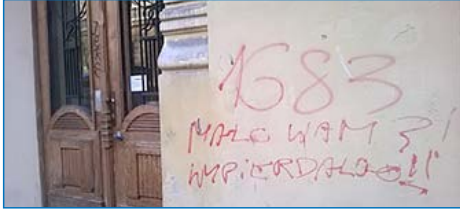
Figure 3. Islamophobic graffiti by the entrance to the Islamic Centre in Krakow which includes a date of the Second Siege of Vienna and the vulgar sentence "Didn't you have enough? Get lost!"

The Polish Defence League claimed responsibility for the targeting of the Poznań Mosque; the former is a radical Islamophobic group (a relatively new offshoot of the English Defence League) that also organised a small-scale demonstration outside the