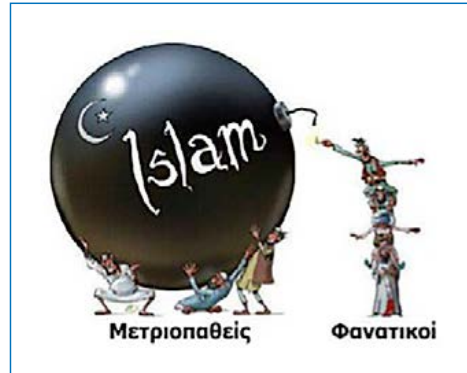
Figure 6: Moderates - Fanatics