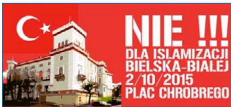
Figure 1. Poster of the anti-Islamisation demonstration organised in Bielsko Biała on 2 October, 2015. The poster reads “No!!! to the Islamisation of Bielsko Biała”.

parliamentary elections held at the end of October 2015. For the first time in the modern history of Poland the issues of supposedly increased migratory influx have been greatly politicised especially by the populist national-conservative Law and Justice Party, KORWiN, and far right groups that formed part of Kukiz'15 13 and played an important role during the parliamentary campaign. As part of this politicisation numerous candidates (especially but not exclusively from the aforementioned parties – e.g. Katarzyna Bielańska from Civic Platform in Kraków) 14 expressed openly xenophobic, racist or Islamophobic views in the media; produced anti-immigration posters; 15 and participated in the demonstrations “against the Islamisation of Poland and Europe” organised not only in the biggest Polish cities, but also in small ones like Bielsko-Biała. The poster of one of such demonstrations in Bielsko Biała can be seen below.