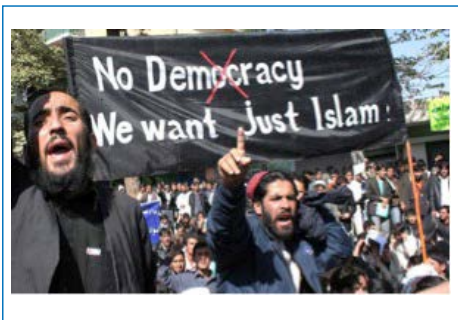
Figure 4: Image from the website ethnikismos.gr .

A website that repeatedly reproduces this kind of discourse is the official website of GD, that actually contains the arguments and ideology of the party mentioned in the above relevant section. 23 Another website that reproduces such discourse is ethnikismos.net ( nationalism.net ). This is another website defending and reproducing nationalist and racist ideas. It is not clear who is behind it, but it is related with GD since one can find its link in GD's official website, while in ethnikismos.gr there are many references to GD's activities presented in a positive manner. Here one can find similar views and arguments about Islam and Muslims. Articles like "Islam out of Europe!" or "When we say no, we mean no! No to a mosque in Athens", 24 are only some of the many that have been uploaded in this website. Most of the articles are accompanied by images that reproduce Islamophobia. (Figure 4) This website re-