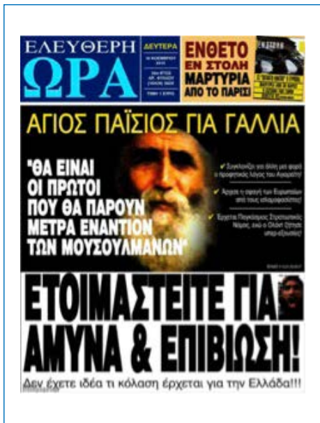
Figure 2: Front page of Eleftheri Ora (16 November, 2015) a few days after the attack in Paris. Among others we read “Be prepared for defence and survival! You have no idea the hell Greece will face!”

Another well-known columnist in the same newspaper, Kathimerini, argued that despite the fact that Islam should not be completely identified with terrorism it is clear that it is closely related with terrorism, arguing that the answer to the question of why young Muslims are becoming violent is not an issue of inequalities but of the religion of Islam