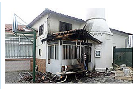
Figure 7: Arson targeting a mosque in Komotini, Western Thrace, in April 2015.

Islamophobia is an aspect of the everyday lives of Muslims living in Greece. First of all, it has to be noted that no major attacks have been noticed, however, there are some minor ones during the year that need to be mentioned. At least two attacks took place in two prayer houses, one on the island of Crete and the other in Komotini, in Northern Greece where a native Muslim minority lives. 33 According to those specialising on Islam in Thrace, which differs from Muslim migrants, the attack in Komotini is related primarily with nationalism and only on a second level, if any, with religious motives. Since the Muslims of Thrace are of Turkish origin issues of national identity come first.