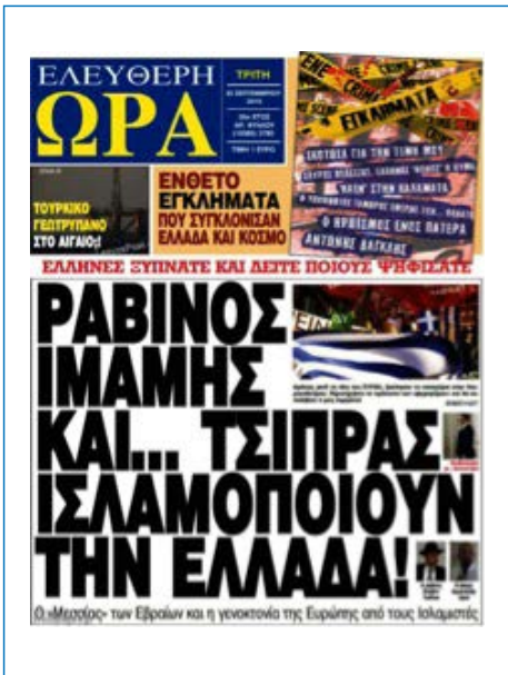
Figure 3: “A rabbi, an imam and Tsipras [the Greek PM] are Islamising Greece”, Eleftheri Ora (22 September, 2015).

Islam”; “The massacre of the Europeans by the Islamo-Fascists just began: Hell is coming for Greece” and “Illegal migrants in Kos were shouting Jihad-Jihad”.